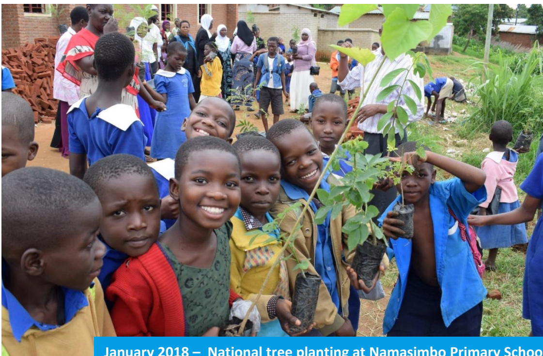
January 2018 – National tree planting at Namasimbo Primary School, Nancholi

Also, Islamic Relief Malawi is working in partnership with The Humanitarian Academy for Development, KR Foundation funded Action on Climate and Consumption project implemented by Islamic Relief Malawi, as part of raising awareness and taking initiative on the project, Islamic Relief Malawi took part in the National Tree planting exercise at Namasimbo Primary School in Nancholi area, Blantyre as of Friday 19.01.18. In collaboration with Smuth Forum, 1,000 seedlings were planted around the school and surrounding areas for reforestation purposes. The area's Chief, Counsellor from the Government of Malawi, PTA committee, School Head Teacher, and community members, were among many other significant stakeholders who came to show their support. The benefits of tree planting are numerous, and we anticipate a positive impact on climate change with such collective efforts. Taking advantage of the rainy season, Islamic Relief Malawi will try and plant as much trees as possible, involving everyone and reminding people that its every person's responsibility to plant at least three trees every year and looking after the trees so as to make sure growth is monitored. We urge you all to take action on climate change and consumption, from planting and conserving trees to mitigating pollution of all sorts as well.