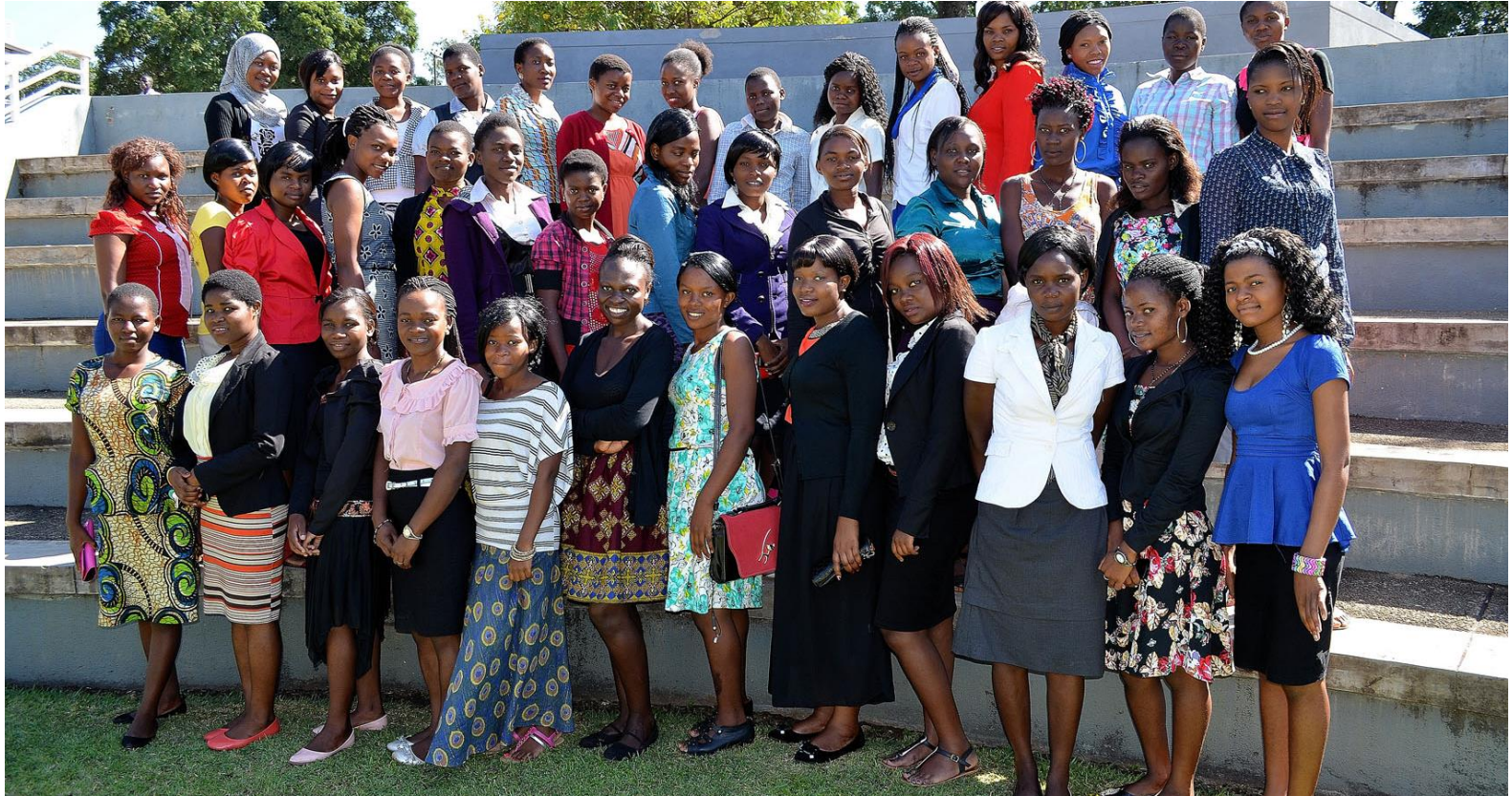
Soko Fund Scholars