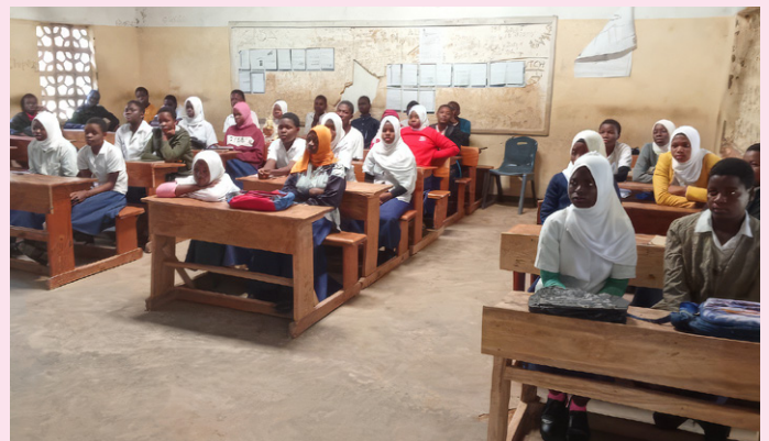
Students at Namang'azi CDSS during their weekend study classes in May 2025.