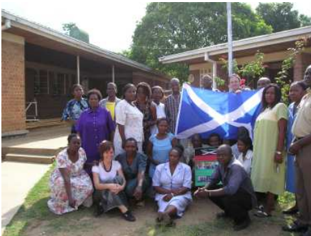
Staff at Chilomoni Clinic, Blantyre (twinned with St. Margaret's Medical Practice, Auchterarder)

In November we visited the ten Malawi clinics in the Twinning Project and witnessed the installation of Internet and computer facilities at several of the clinics. The provision of the same, or better, technology as we enjoy in Scotland, will enable our Malawi partners to communicate on an equal platform about case problems and continuous professional development.