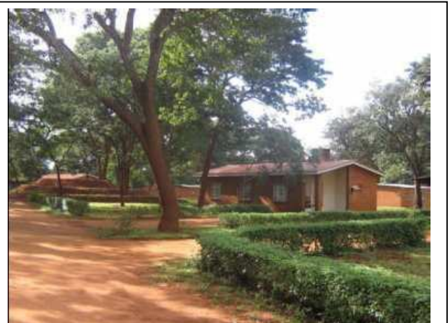
Accommodation for the Scottish Fellow in Mzuzu

The travel costs of Scottish Fellows will be covered and the Partnership has funded dedicated accommodation in Zomba and Mzuzu which has proved highly satisfactory for the Scottish Fellows. A generous living allowance of £500 per month is awarded. Inductions and language lessons are also provided.